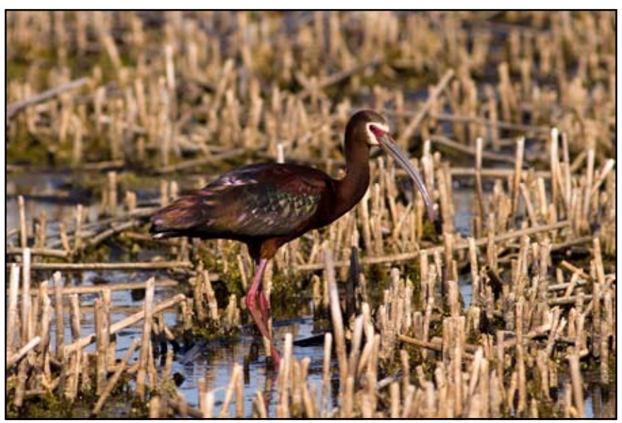
White-faced lbises were much more widespread than normal this spring. This individual was photographed at Fish Point Wildlife Area, Tuscola Co. on 21 May 2009.