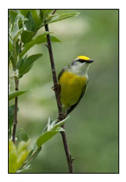
This cooperative "Brewster's" Warbler was photographed at the Port Huron SGA, St. Clair Co. on 30 May 2009.