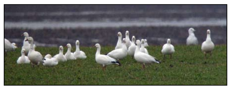
More Ross's Geese were recorded this spring than ever before. At least 5 Ross's Geese were in this interesting group of 17 small white geese in Berrien County in March 2009.