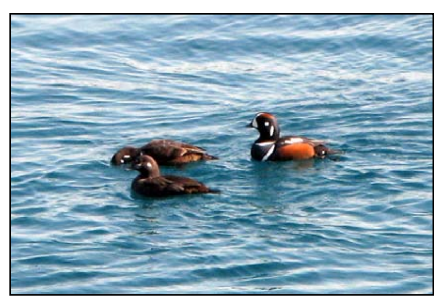
These three Harlequin Ducks were photographed at Port Huron, St, Clair Co. on 27March 2009.