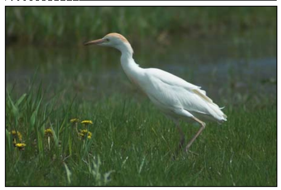
An extraordinary number of Cattle Egrets found their way to Michigan this spring; this individual was one of two at Sterling SP, Monroe Co. on 27 April 2009.