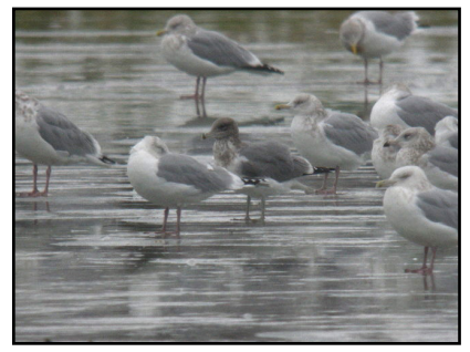
This California Gull was photographed at Three Oaks on 24 November 2008.

CALIFORNIA GULL (0,0,1) A third cycle bird on 24 Nov at Three Oaks, Berrien (TB)(p.a.).